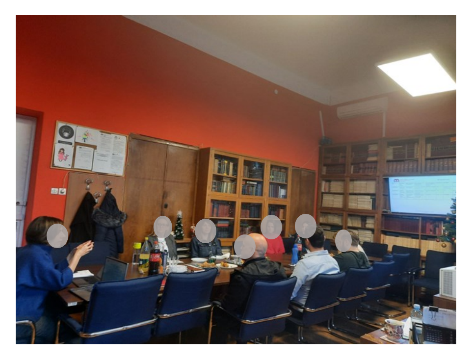
Photo 1. Public discussion in the library of the Institute for Medical Research, National Institute of the Republic of Serbia, December 12, 2023.